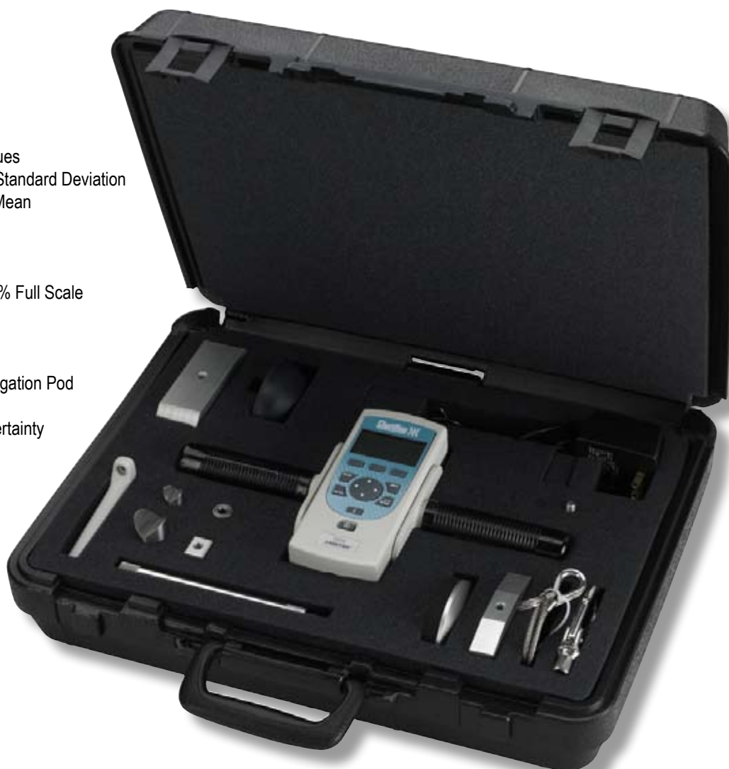
Shown: X3328 Series with standard accessories