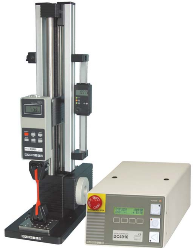
The ESM-DC is shown in a typical tensile testing application, with Series BG digital force gauge, digital travel display, limit switch kit, and wedge grips